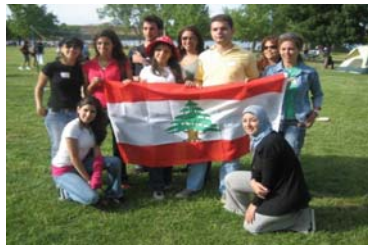
June 03 Annual Lebanese Community Picnic, Pleasanton, CA The proud Lebanese interns