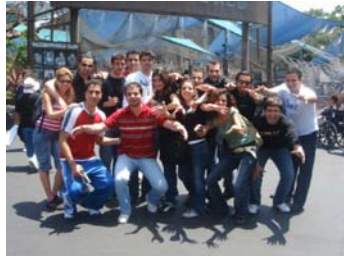
May 27 A fun day spent all together at Universal Studios. Los Angeles. CA