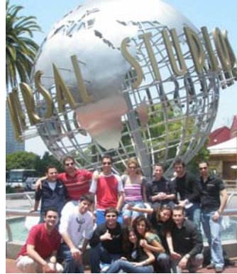
May 27 Universal Studios, Los Angeles, CA Group Photo ... Say cheese!!