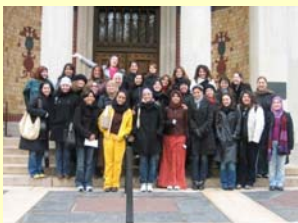
The 37 MEPI interns during their stay at Wharton