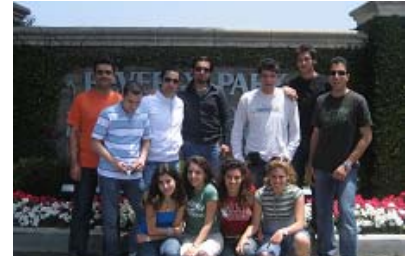
May 26 Beverly Hills, Los Angeles, CA City of the Stars ... but we did not see any!