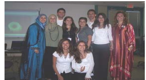
June 28 Middle Eastern Cultural Event, Cisco

Did you know that half the world's population is under 25 years of age?