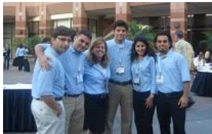
July 16 NetAcad Conference, Long Beach

Bachelor of Computer & Communications Engineering (Minor in Economics), American University of Beirut, expect. June 08