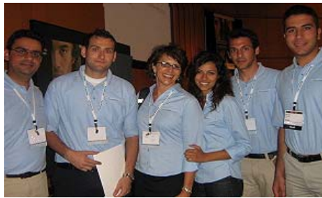
July 9 NetAcad Conference, Cleveland