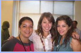
August 23rd Farewell MEPI