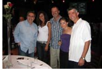
July 22 th Peace & Freedom Fundraiser Families - Fairuz Restaurant