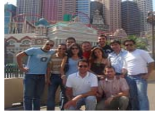
August 3 - 5 Viva Las Vegas!