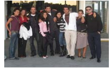
July 24 th San Francisco Bay Cruise & Dinner