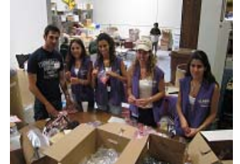
July 28 th Volunteering at RAFT