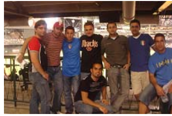
July 24 th Baseball game – Arizona Diamondbacks Stadium